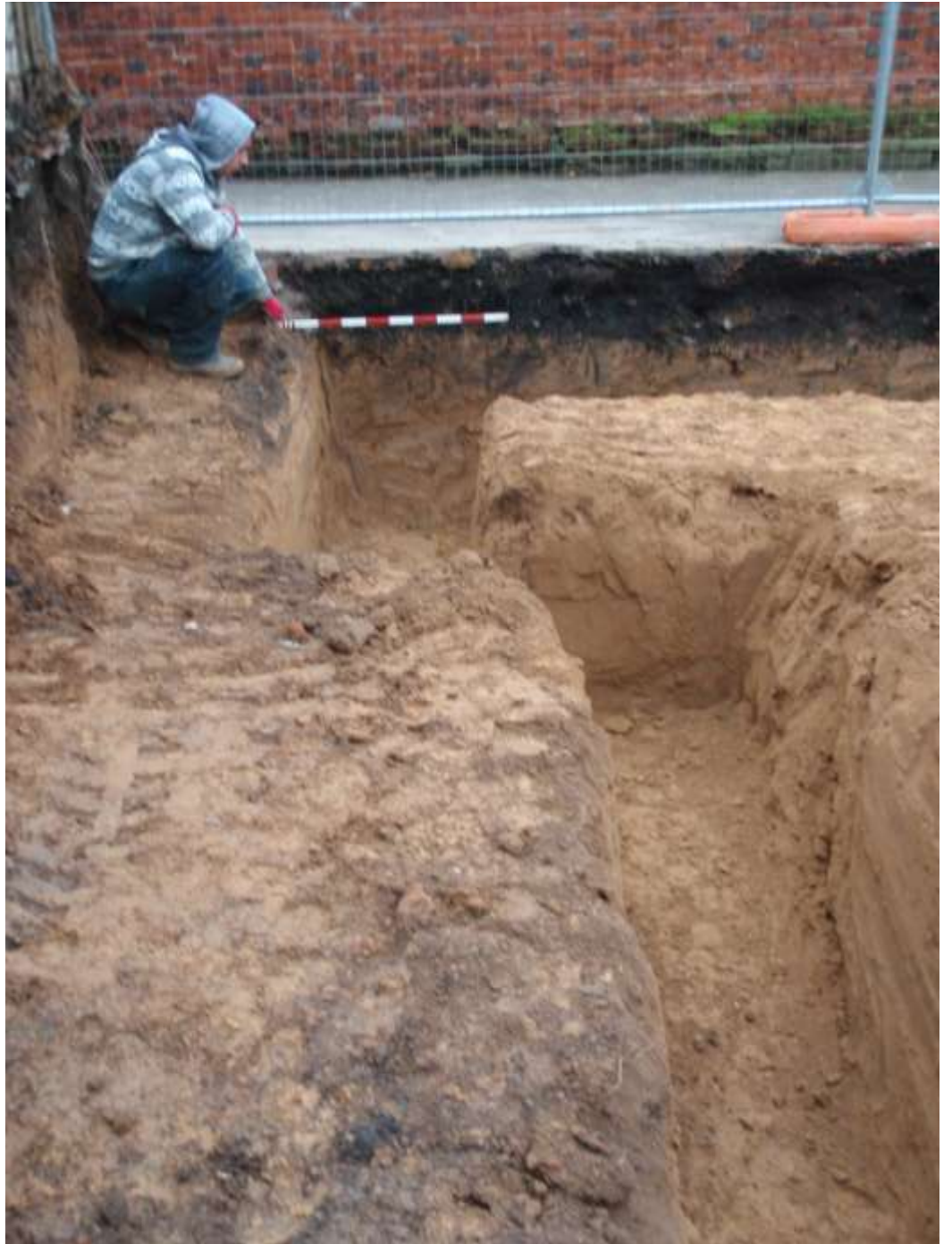
Plate 7. Cutting of foundation trenches (north side)