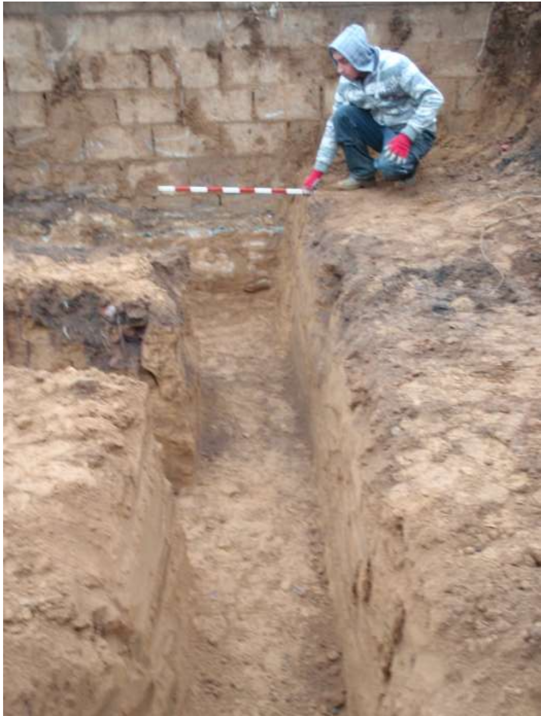
Plate 6. Cutting of the foundation trenches (south side)