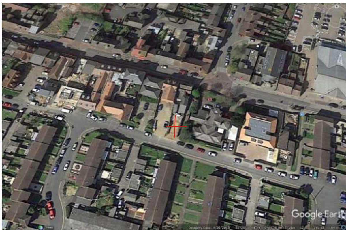
Plate 1. Aerial view of site (red target) showing the site prior to development.

(Google Earth 20/4/2015: Eye altitude 164m).