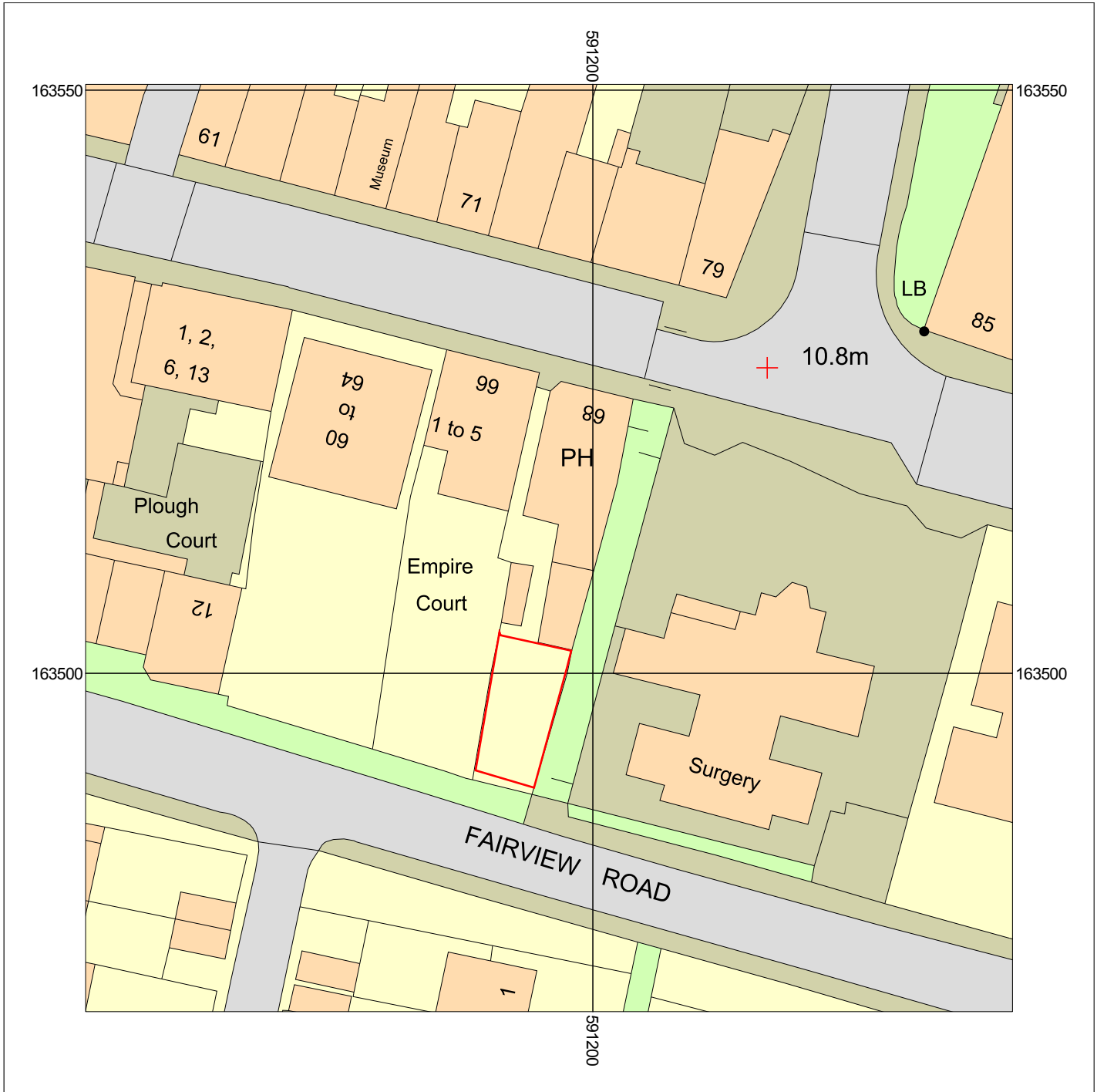
Figure 1. Extent of Watching Brief within red rectangle