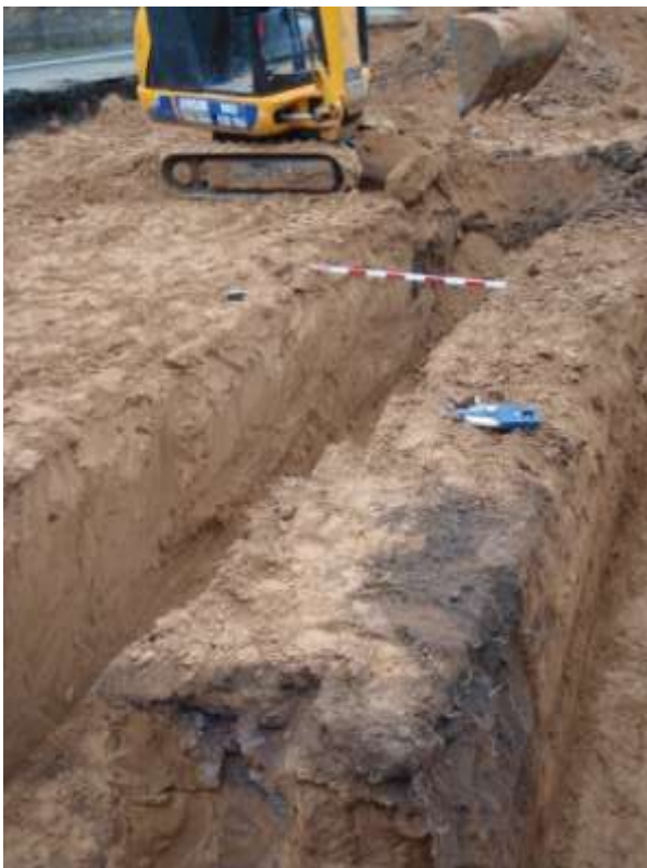
Plate 3. Cutting of trenches