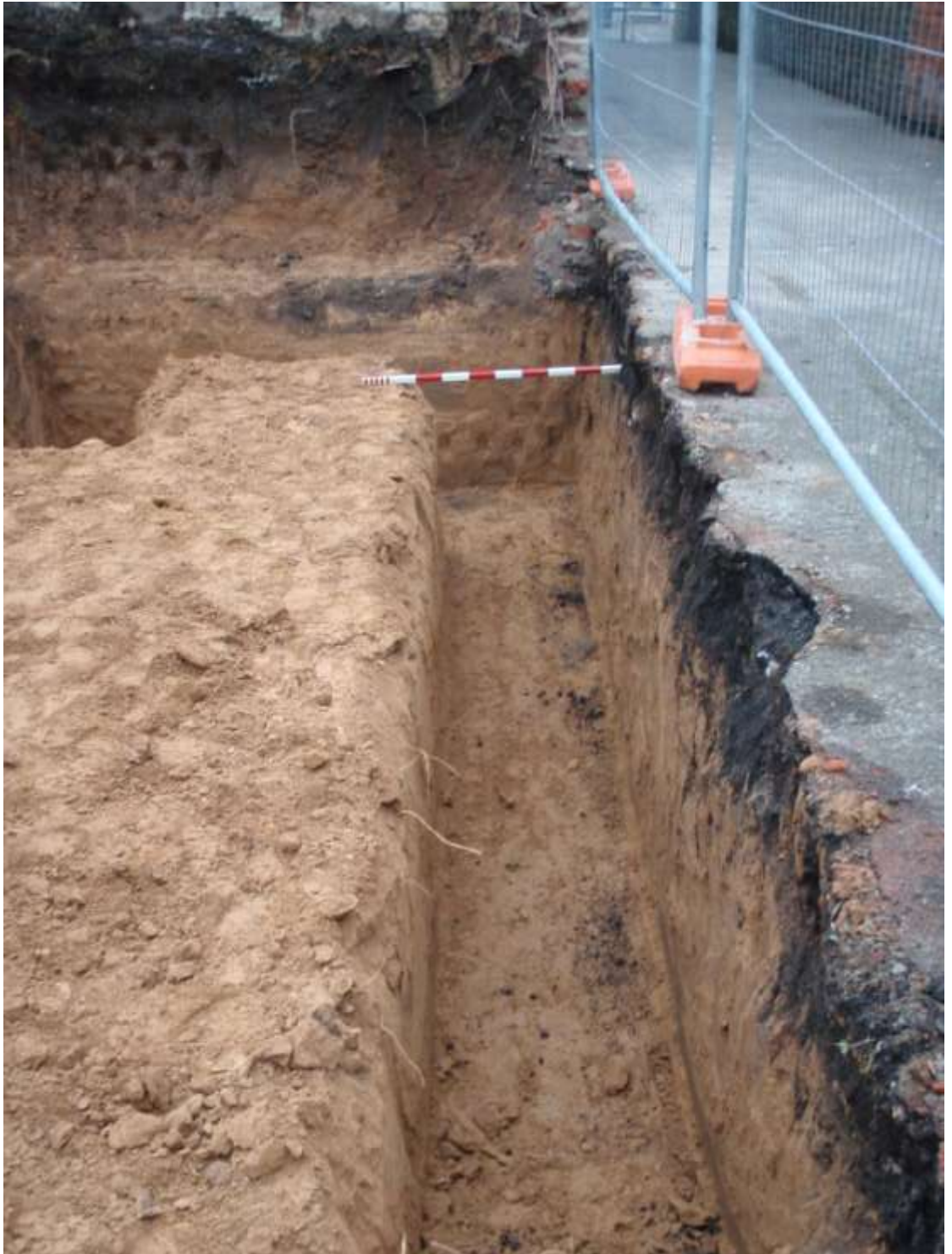
Plate 5. Cutting of foundation trenches (east side)