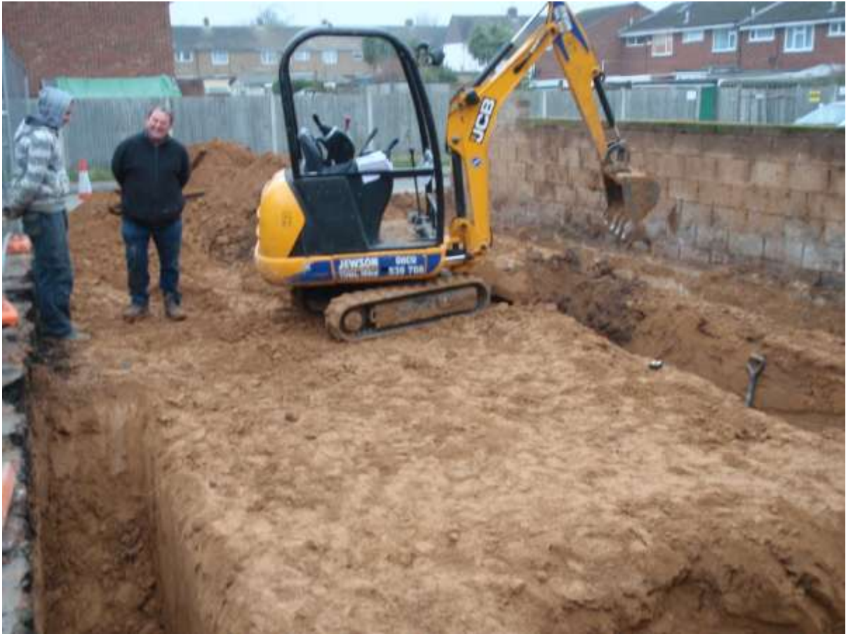
Plate 2. General view of site (looking SW)