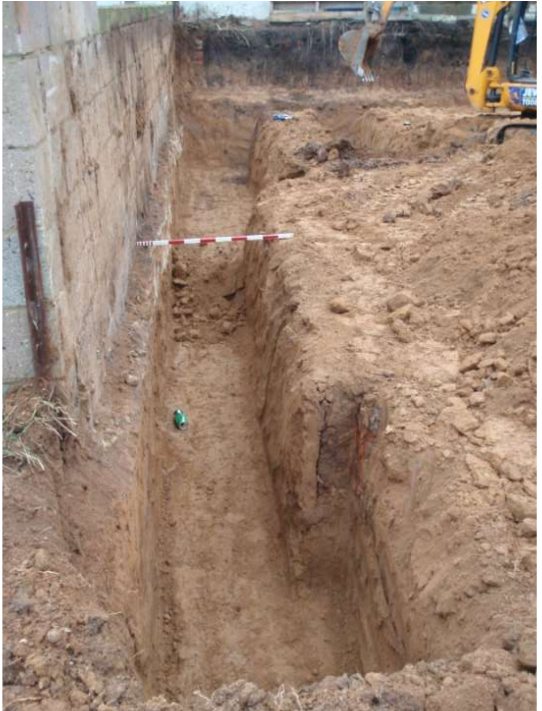
Plate 4. Cutting off foundation trenches (west side)